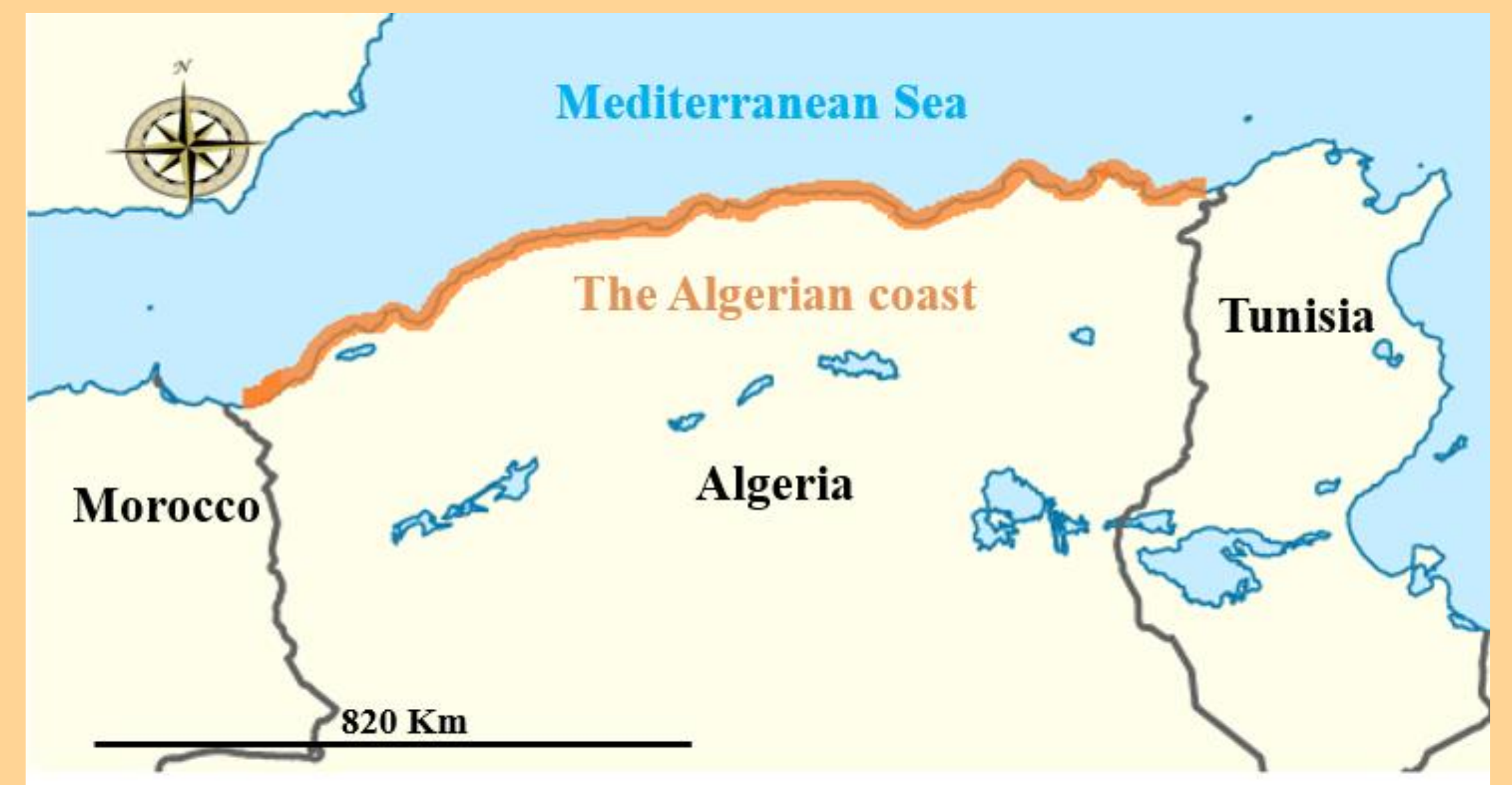
Fig. 2: The Algerian coast.