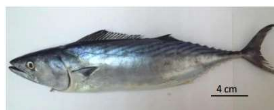
Figure 2: Sarda sarda