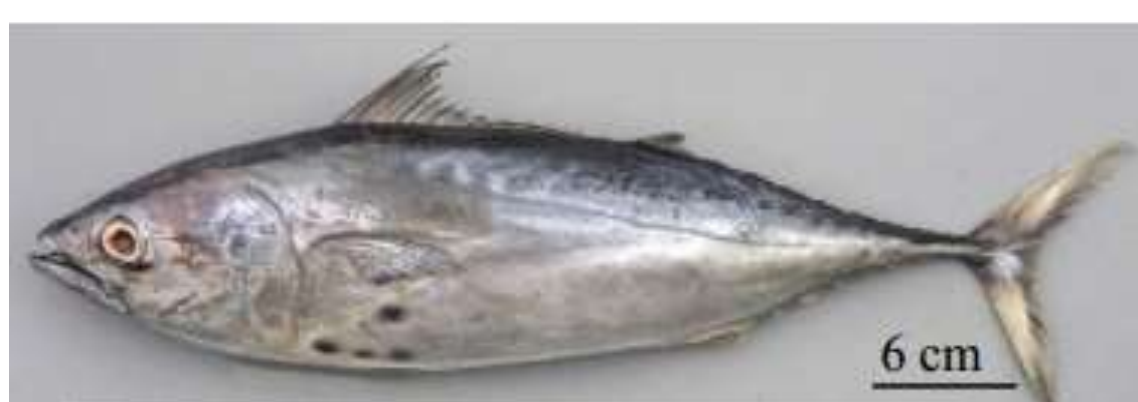
Figure 1: Euthynnus alletteratus

Forty-five little tunny, Euthynnus alletteratus (fig. 1) and thirty-five Atlantic bonito, Sarda sarda , (fig. 2) caught off three localities (Bouharoune, Algiers and Cap Djinet) of the Algerian coast (fig. 3) were examined for parasites.