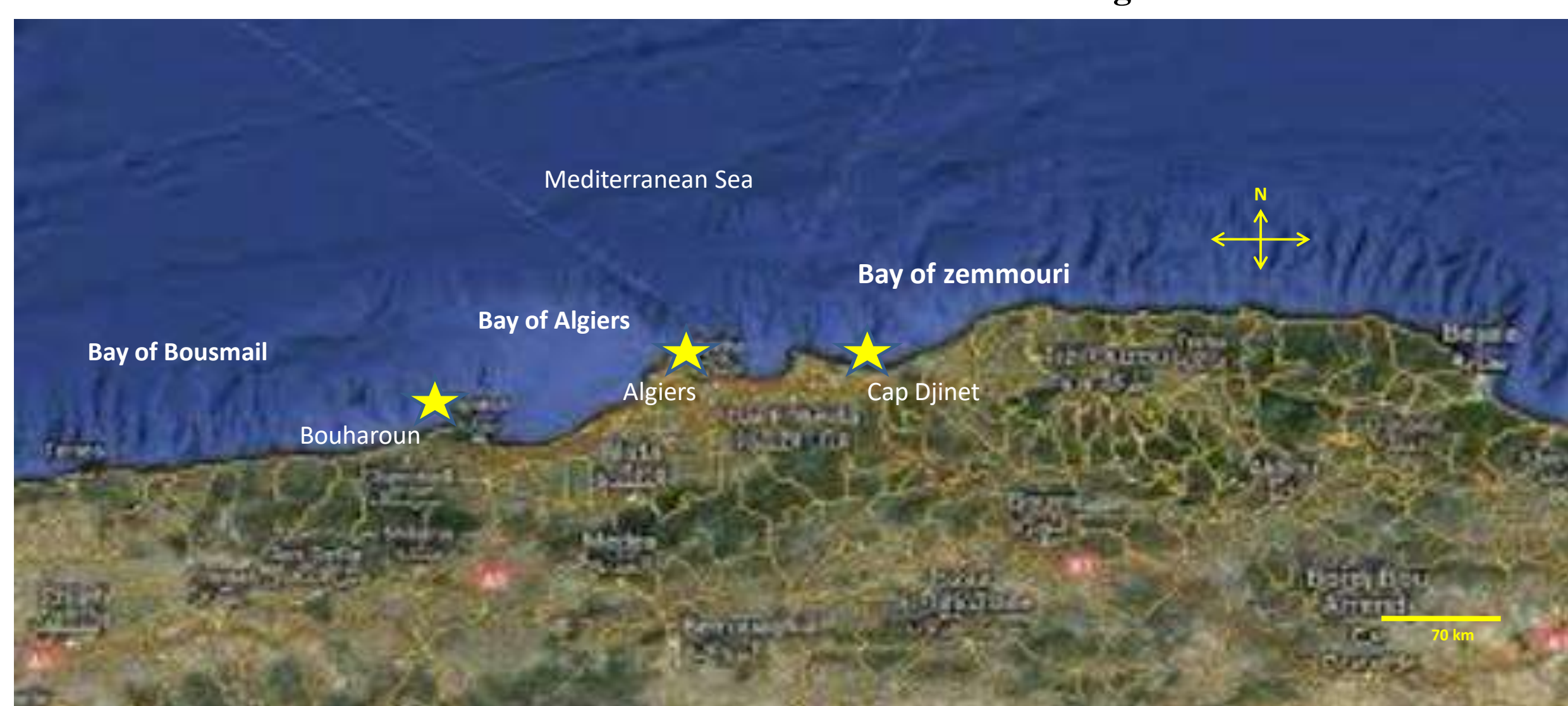
Figure 3: sampling area for the studied fishes

After the examination of the gills, Monogeneans were removed and stored in 70% ethanol. All specimens were stained for a morphological study.