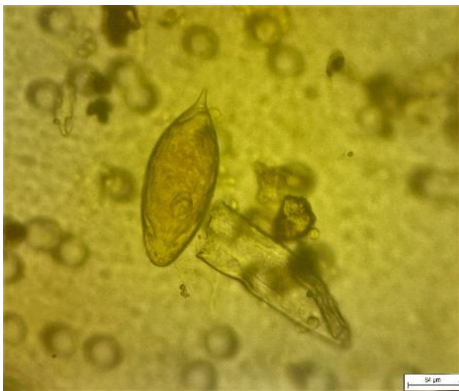
Normal egg shape