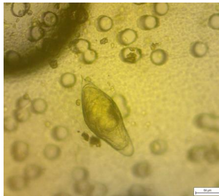
Spindle shaped egg